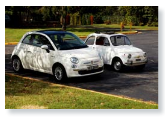
2008 Fiat 500 displayed next to its predecessorthe 1966 Fiat 500