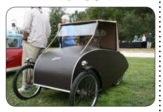
The 1945 Mochet Velocar on display at Hilton Head Concours.

three cars – the Peel P-50, the Iota 350 Sport and the Mochet Velocar. All the cars were a big hit, especially the P-50. Since the show field and hotel are about five miles apart, I drove the P-50 around the island for the weekend. Needless to say, people absolutely loved seeing it driven, and parking was never a problem.