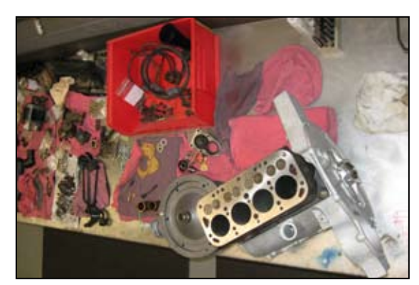
The 1924 Citroën 5CV Engine gets an overhaul!

The mission of Lane Motor Museum is not only to collect cars but also to preserve and restore them for future generations. Enjoy this look behind the scenes at some of our current projects!