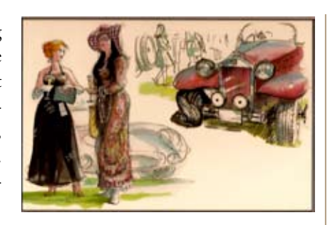
This illustration was given to the author as a gift following the events at the Pebble Beach Concours d'Elegance. The artist is unknown.

the car, not being too anxious to ride in it with its flat tire (he was probably embarrassed), and I jumped in. Hundreds of people in the crowd were trying to warn us of our flat as we drove up, but drive on we