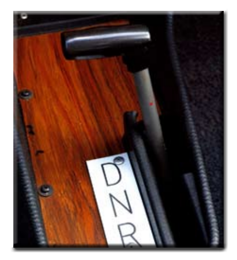
Do Not Resuscitate?

But guilt is powerful, as is the need for a watertight heated car at times, so it was time for a DAF. I chose the Marathon 1300. It has a bigger water-cooled (read: working heat) engine