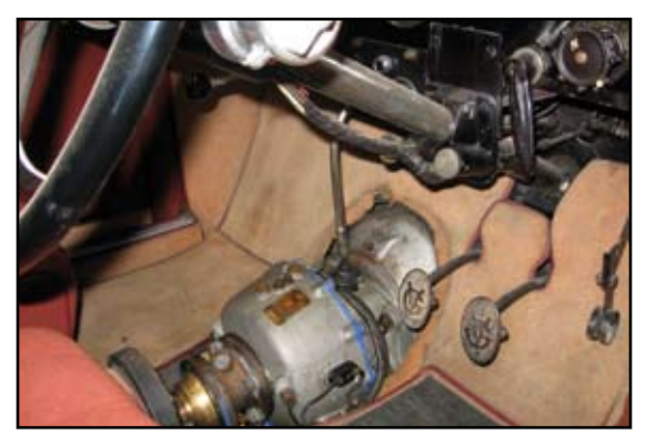
The Cotal Pre-Selector Gearbox exposed as it is repaired.