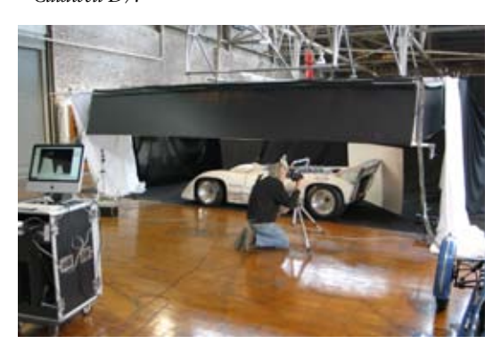
After hours of preparation they are finally ready to capture the photos needed for an upcoming book to be titled Can-Am Cars In Detail. The book is expected in 2010.

good point-and-shoot digital camera may be 8 MB or so. These were not only large images, but they are of extremely high quality. I can't wait to see them published!