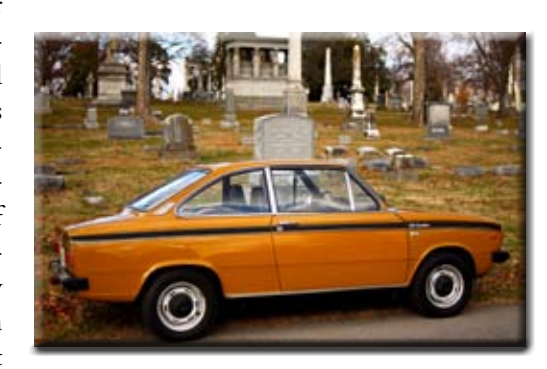
DAF cars passed away in 1975.

The Marathon served me well and will be in a more regular rotation along with the other DAFs. The driving experience is pleasant due to its simplicity and that simplicity is created by the complexity of the machine. I solved the problem of changing directions by letting the car fully come down to a low idle and quickly engaging a different direction, so once again, I was to blame, not the car. They are fine cars that approached the problem of getting power from the engine to the wheels from a different perspective. And the heat works.