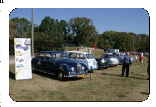
The Lane Motor Museum at the British Car Show in Franklin, Tennessee last October.

Our next big event was Lane Motor Museum's 5th Anniversary celebration on October 18. We had a busy day giving rides and demonstrations. The museum was very fortunate to