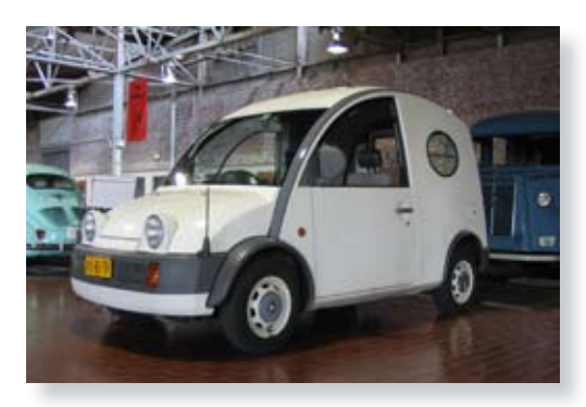
1989 Nissan S-Cargo