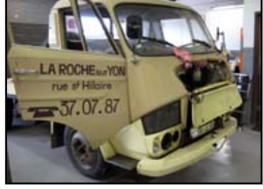
The 1967 Matra Djet 5 (L) and the Citroën Type 350 Truck are now on display!