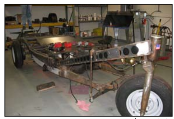
The chassis of the 1932 Dymaxion awaits paint & a new body!