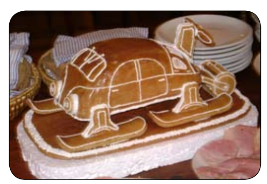
The long awaited Tatra Aeroluge and its controversial history comes out of the oven January 8. Visit to see the real one on display!