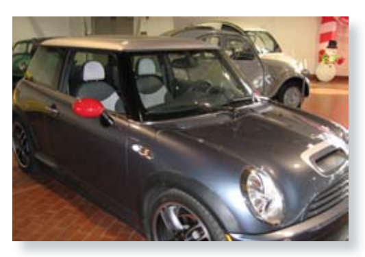
2006 BMW John Cooper Works Mini