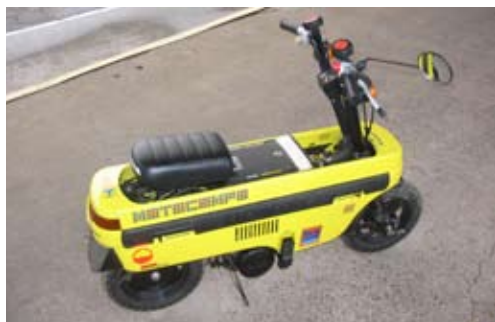
1984 Honda Motocampo Scooter