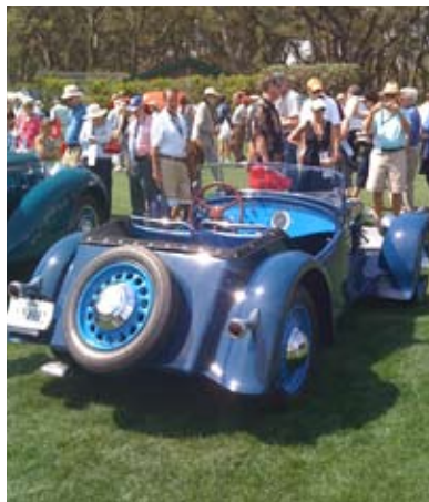
The Georges Irat on display at the Amelia Island Concours event.