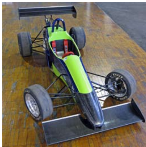
2002 PCD Saxon Race Car