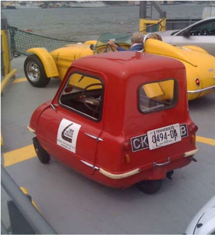
The Peel P-50 enjoys a rest and the view during a ferry ride across the St. John's River in Jacksonville, FL.