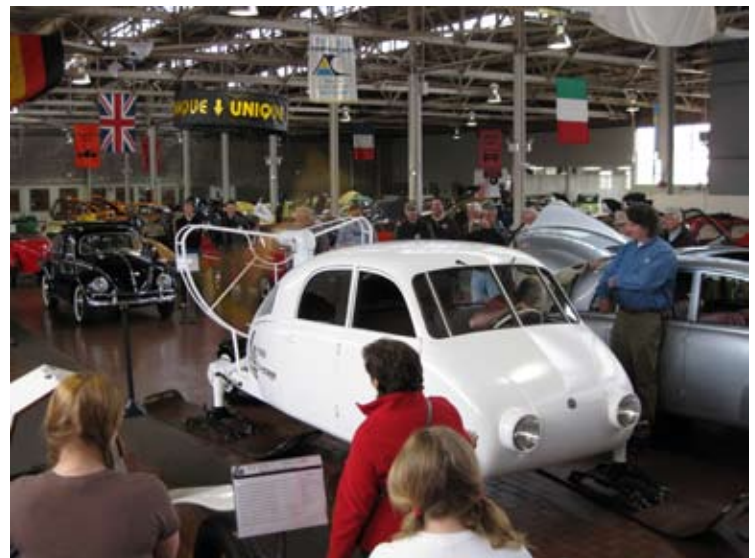
Visitors at "Vroom...Start Your Engines" get a chance to see a demonstration of the Tatra Aeroluge.

On April 16th we will open a special exhibit which celebrates the 50th anniversary of the Mini. The museum is proud to have this event sponsored by MINI of Nashville. We will have eleven different