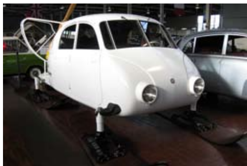
1942 Tatra Aeroluge- Front View