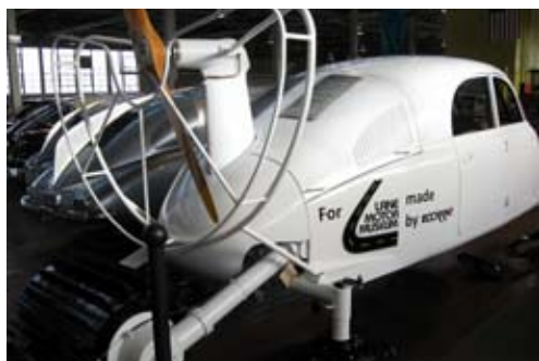
1942 Tatra Aeroluge- Back View