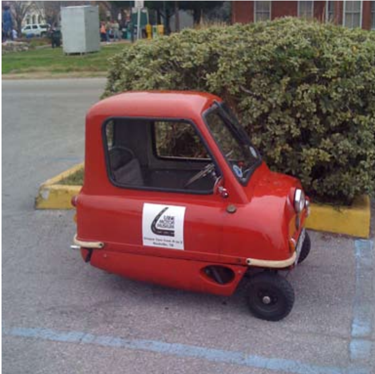
Parking is rarely a problem with the Peel P-50!

the Amelia Island Concours, participants do not have to drive an old car – in fact, most people drive modern cars. As I pull into the parking lot I am greeted by a mixture of laughs and smiles from the crowd hanging around. No one really believes I am going to drive this Microcar on the tour – after all, it only weighs 220 lbs., and reaches a top speed of just 25 mph. My thought is – it’s only fifty miles, a mere two hours of driving time.