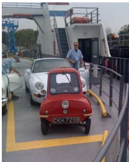
Is that Porsche 911 drafting me or tailgating me?

To be continued next issue: Peel Antics at Amelia Island on Saturday