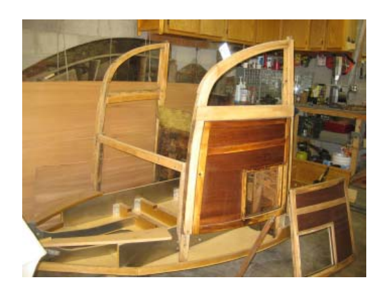
Top Left: The Martin Stationette prior to initial restoration work.

Top Right: Recent photo of the Stationette during restoration.