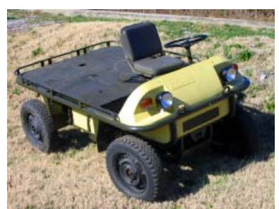
Above: The Lohr...my beautiful, French mule!

When I was younger it was always hard to sleep on Christmas Eve, and Christmas (and some of the collection) arrives several times a year at the Museum in the form of sealed containers delivered by truck drivers instead of Santa. The truck drivers cut off the seals and reveal the contents. Excitement comes in a container with lots of straps, nails and the smell of old gasoline. The unloading begins. It is dirty work and it is hot work in tight confines. All of the tire chocks are nailed to the floor of the container. If I was going to nail down a chock I would use 2, maybe 3 nails. Seems sufficient. But I do not own a nail gun. If I had a nail gun I might use 10 nails, just to be safe and because it is fun to shoot nails with a nail gun. Once the puzzle is solved on how to extract the vehicles intact from the container, all that is left inside are a couple