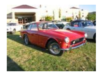
Above: An Italia 2000 Coupe.