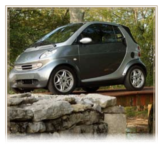
The egg shape of the Smart Car allows for a surprising amount of passenger space.

[Sue] What is up with the gearing? There's a 'manual' shift, but no clutch. You're prompted to shift up or down by little arrows on the dash, but have your left foot free to do absolutely nothing. There's no gear pattern, just a neutral position and pushing the shifter forward makes you go faster and pulling it backward makes you go slower. It takes a minute to get used to it, but it's something different and if you don't use the 'manual' option, it's slow. Real slow. And jerky.