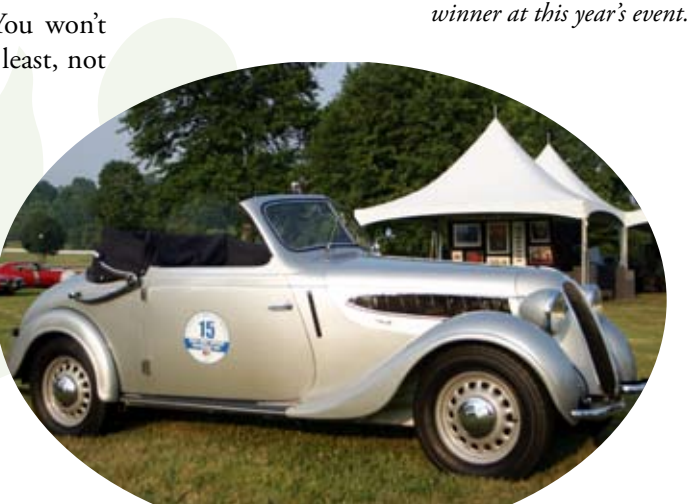
The museum's 1938 BMW 320 Cabriolet on display at Keeneland.

Less than 4 hours from Nashville, the Keeneland show promises to grow, and the number and quality of the cars on display are on par with many other major concours. Highly recommended — look for it next July!