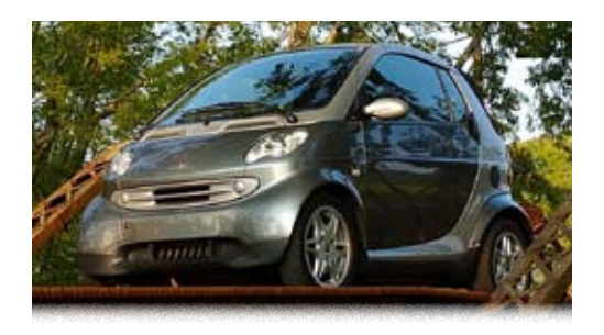
Since it weighs less than 1800 pounds you don't have worry about crossing a rusty old bridge.

which is the difference between luggage for a week, or luggage for the weekend. The convertible top, which can be positioned both as a sunroof or a full convertible is a fun feature for a commuter or as a daily driver.