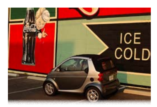
The air conditioning keeps passengers refreshed.