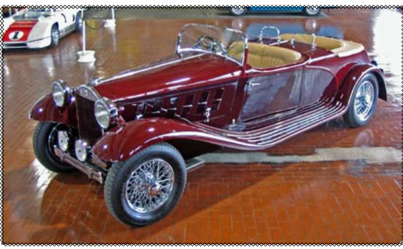
The finished product. The 1932 Lancia Dilambda as it is seen today on display at Lane Motor Museum.

The final "push" was done at our house. For the last month, we had between 2 and 6 people working every day for 9-12 hours (some days more).