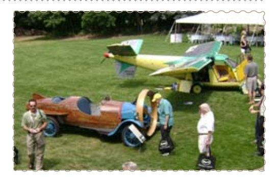
The Helicron and the Aerocar paired together for a display of unusual propeller-powered vehicles.

This year we took the Martin Aerodynamic and were rewarded by winning the People's Choice Award.