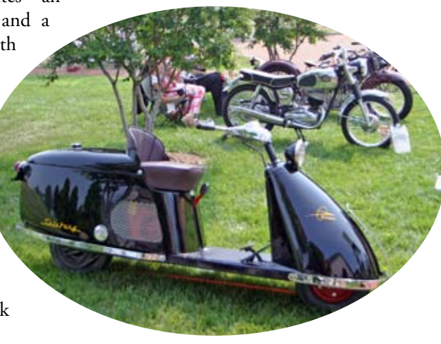
The 1947 Salsbury Superscooter was a hit with some of the event volunteers!