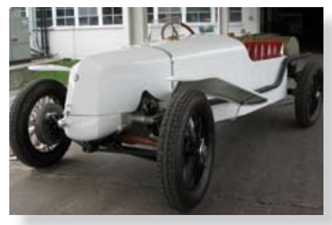
1925 Tatra Targa Florio Race Car