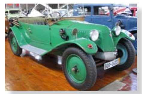
1924 Tatra T-11