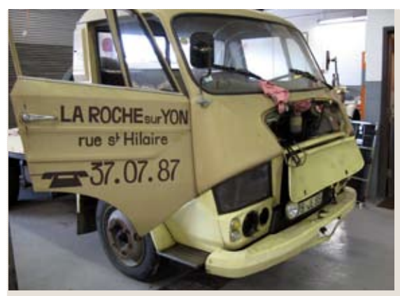
1968 Citroën Type 350 Truck

This workhorse truck is receiving a new radiator and some repairs to its aging headlight assemblies.