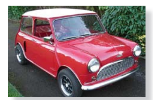
1965 Twini Mini Replica

The 1939 Crosley convertibles and sedans were first shown in April of 1939 at Indianapolis Motor Speedway. The cars weighed 925 pounds and could be purchased for $325 through large department stores and appliance retailers.