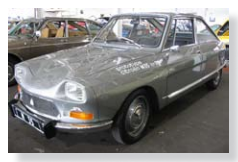
1970 Citroën M-35 Monorotor