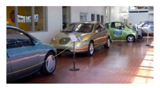
Nissan Cocoon, NCS-1, and HyperMini concepts