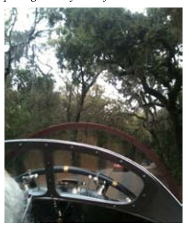
Andrea's view as the Leyat travels a scenic road near Fernandina Beach, FL.