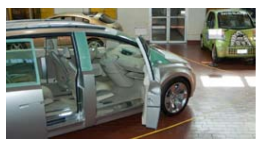
Nissan Quest and HyperMini concepts