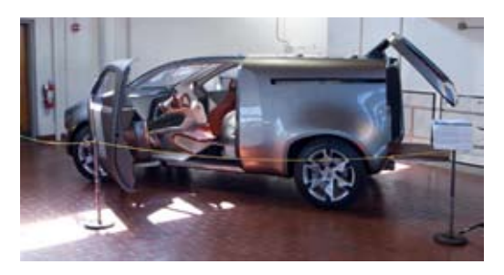
Nissan Bevel Concept