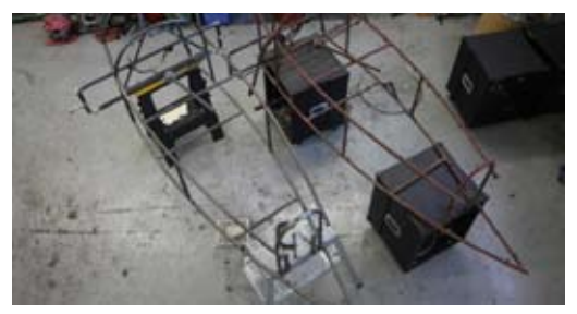
A side-by-side view of the new frame (left) and the original frame (right).

The restoration and reproduction of the 1930 propeller driven E'Clair has made substantial progress in the last 6 months. The reproduction frame and metal work has been completed.