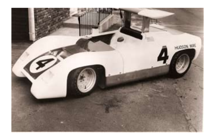
The 1967 Caldwell D-7 in its early days.