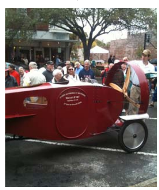
A crowd gathers around the Leyat

On the way up we never got over 25 because we were in a convoy. Now we were on our own, and I would be able to evaluate how the rear wheel steering in the Leyat works at a higher speed. Of course there is no speedometer, but on the way back I estimate we were driving at 35-40 mph. The car was quite stable, and on flat, level ground only about ¼ throttle is needed to achieve this speed.