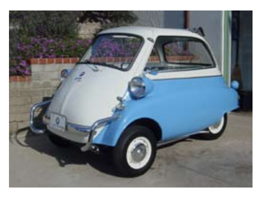
This 1957 BMW Isetta 300 sold for $46,750 at RM's Sports & Classics of Monterey auction in August 2009.

Conventional wisdom might say that microcars had their day in the sun several years ago, and that they're just not the flavor of the month anymore. And while we might