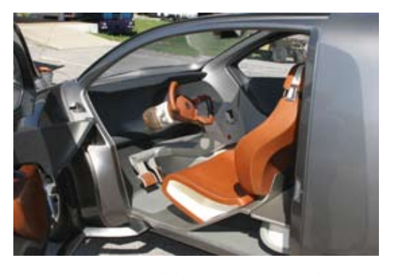
The space age interior of the Bevel concept; something better seen in person to appreciate.

The Bevel, which is one of the more interesting concepts, I realized would be a problem to move. To open a door, it had to be plugged into an electrical outlet. Using multiple extension cords we were able to access the fantastically futuristic looking interior. The "drivetrain" of the Bevel is basically a low-powered golf cart with a dead battery. With the Bevel plugged in, the battery charger puts out enough juice for the Bevel to creep at a snail's pace if you have 4 people to help push. The steering wheel is vaguely connected to the front wheels. The normal 10 and 2 o'clock positions do not remain constant after a turn, changing by as much as 180 degrees at times. Were