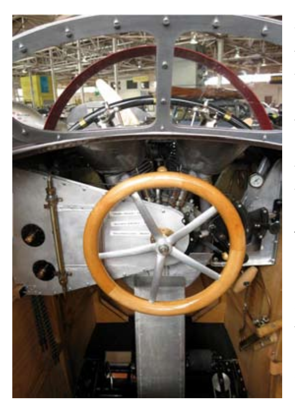
The view as seen from behind the wheel of the Leyat.

vehicle moves away slowly, then the throttle should be moved up to full (the throttle is not a traditional foot pedal – instead it is a lever that is adjusted with your right hand, and once the throttle is set it stays in that position and will not spring back.) Keep an eye on the fuel pressure, remembering to give it a pump when necessary. The steering is very quick but heavy, and remember the rear wheels are the ones that steer. With the quick steering you need to work hard to not overcorrect – let the vehicle flow a little bit. As you gather speed, cut the throttle back to keep the speed at a reasonable level. The turning radius is very long, and don't forget, reverse is your feet (i.e. you have to get out and push!) The driver will also notice that he/she is sitting very high in the vehicle and when turning, the body also leans into the corner (it was designed like this) which at first feels like you might tip over, but you soon get over that fear.