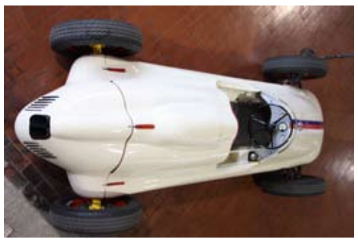
A view from above

In the late 1940's, Tatra realized it needed to introduce a new car in the next few years. Tatra decided that this new car would have an air cooled V-8 engine similar to the very successful Tatra T-87 built from 1936-1950.