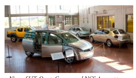
Nissan SUT, Quest, Cocoon, and NCS-1 concepts

What is a "concept car"? Concept cars are rolling experiments that automakers use to try new ideas, new materials, or new looks. They are generally displayed to the public at major auto shows, and the reactions of the public, industry analysts, and the motoring press is carefully studied. Some may never make it to the show stage, killed off in committee before seeing the light of day, although to some extent computer 3-D modeling has taken the place of expensive full-scale designs.