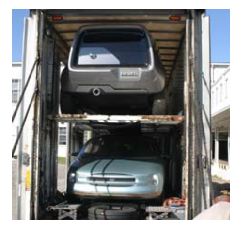
The arrival of Nissan's concept cars

The newest exhibit features six of Nissan's concept cars from the past two decades. They are definitely interesting to look at and hold some innovative ideas, although the practicality of some of those ideas is still in question. When they arrived over a year ago it became apparent that these were no regular cars. It took the majority of a day to unload them from the transporter and put them in the basement. On that day, it was