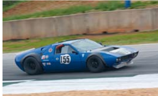
What’s the last time you saw a ’69 DeTomaso Mangusta racing? Me neither!