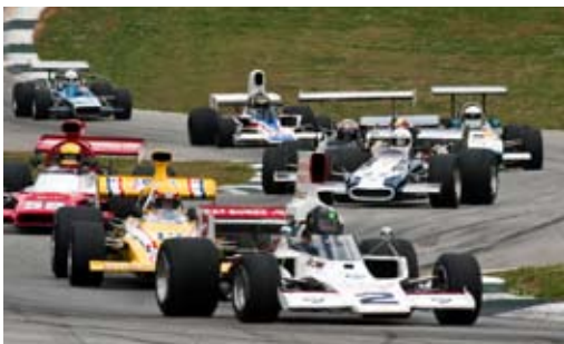
The B.O.S.S Series stands for Big Open Single Seaters, and is comprised of ex-Formula One, F5000, Indy, and Formula A and C cars. The ground shakes and babies cry. It’s great!