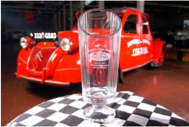
The 1952 Citroën Cogolin won People's Choice at this year's Ault Park Concours d'Elegance.