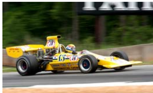
This ’71 Lola T192 was nicely presented in period livery.