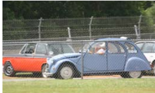
See, I told you there were oddballs here, both on and off the track. Sunday morning we parked next to each other in the infield, comprising the entire French contingent, I believe. No trophies, however.