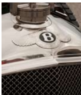
A walk through the pits should never be neglected – you’d miss beauties like this...