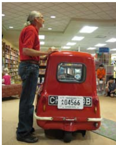
Showing the Peel P-50 to a group of kids at Davis-Kidd Booksellers.

June 12th was the date of the Ault Park Concours in