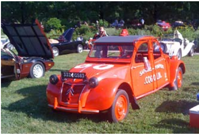
The 1952 Citroën Cogolin on display at the 2010 Ault Park Concours d'Elegance.