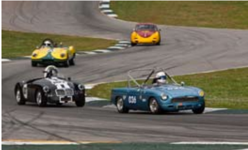
Classic – a “B”, an “A”, an Elva (“She goes”), and a 356, sweep through Turn 5.