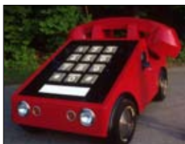
The Phone Car ©Howard Davis

3. The Big Red Phone car - This 1975 VW Beetle was transformed into exactly what it sounds like – a big, red telephone. Complete with a keypad, receiver and matching owner/mascot, this car is not easy to miss.