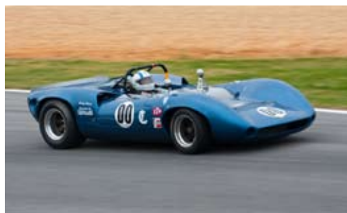
This ’66 Lola T70 Spider was nice to see. It’s representative of the very early days of Can-Am racing, with Lola winning the first championship in 1966.