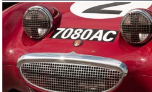
What’s a vintage race without a true Bugeye?