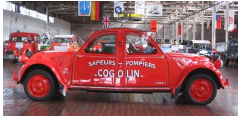
If you've never learned the "raison d'être" for this two-headed 1952 Citroën Cogolin, click the image to learn more.

As I give tours to groups, and even just talking with individual visitors, I am finding myself more and more trying to explain why some of these cars exist. Sure, just wandering through, looking at all the weird (their words, not mine!) cars can be satisfying in itself. But isn't it more interesting to think about the context in which these motoring marvels were created? No matter how "weird", every one of these cars had a raison d'être .