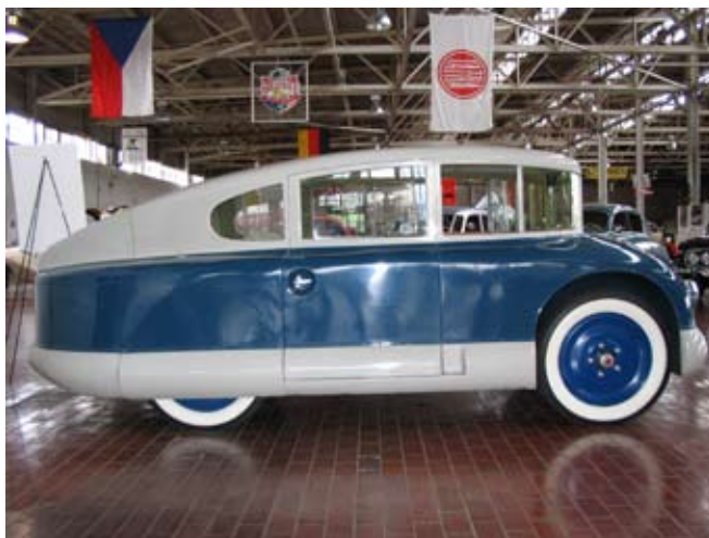
This 1928 Martin Aerodynamic was built by the Martin Aeroplane Factory. Do you see the influence?

Cars are a product of many factors. The background of the designer can certainly be a huge influence – it's easy to see the airplane elements in the materials and design of a Voisin or a Martin, for example. The raw materials available also come into play – the Trabant, with its agricultural waste-derived "fiber"glass is a good example. We must also consider what was going on when and where a car was produced. The post-WWII rebuilding of Europe, along with the Suez Oil Crisis of the mid-1950s were both huge influences on car design of the period. There had been microcars before, but this period brought an unprecedented boom in the tiny conveyances, especially in Europe. These contexts – the Who, What, When, Why, and Where – are especially interesting to me. Without delving a bit below the surface of these cars, they are simply objects – some pretty, some purposeful, and some, well, a bit homely.